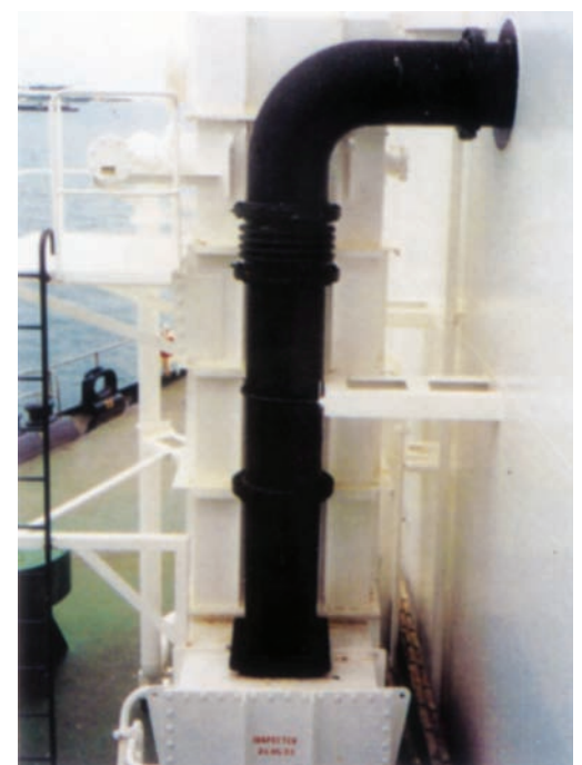
Inert gas line coated with T-GUARD

WWW.STARMARINE.NL is the sole supplier of RESKOTE T-GUARD .